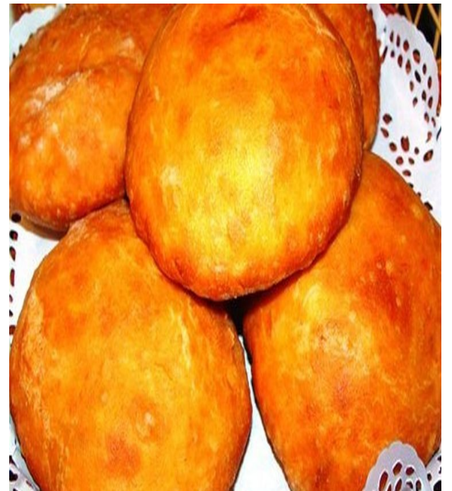
The Island: Johnny Cake